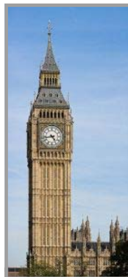
London Clock Tower